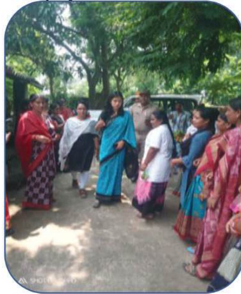
My Pad My Right visited by District Magistrate and Collector Sambalpur, Bargaon, Maneswar

The "My Pad My Right" (MPMR) project was a timely initiative in the district, addressing the issue of menstrual hygiene that had been largely ignored and underplayed in the rural pockets of Odisha, especially in the interior tribal areas. The production unit was established in Bargaon Village of Maneswar Block in Sambalpur district. While the project functions as a commercial unit, the members are also actively involved in creating awareness and educating other groups. ADARSA has played a significant role in promoting the usage of sanitary pads. They have achieved this by organizing health and awareness camps in collaboration with the block office, involving PRI members, SHG group members, civil society organizations, doctors, media, and officials from the health department. Despite the challenges posed by the pandemic, within just four months, SHG members successfully produced 16619 sanitary pads and sold 15233 pads, generating a total revenue of Rs. 60,932.