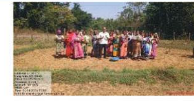
TR. ON NURSERY RISING