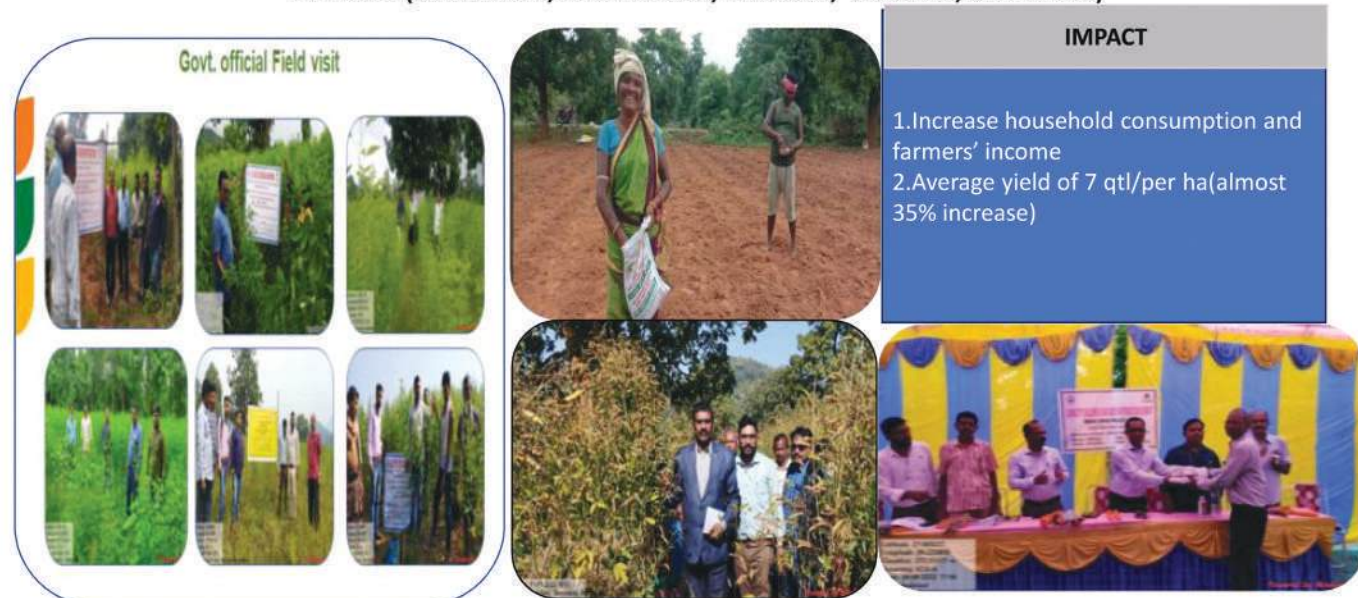
Kharif Pulses Project - ICARDA

PROMOTION OF PULSES ( ARHAR) SUPPORTED BY ICARDA DISTRICTS (SAMBALPUR, SUNDERGARH, BARGARH, NUAPARA, KALAHANDI)