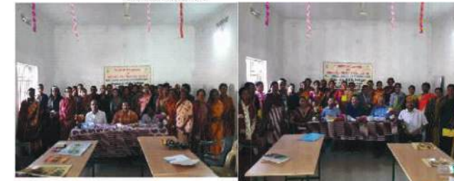
TR. ON ORGANIC VEGETABLE CULTIVATION