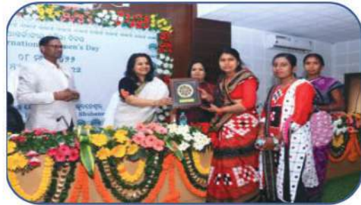
My Pad My Right, Award received by the Shiv Shakti SHG at State level by NABARD