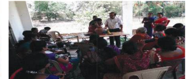
TRAINING ON HAANDIKHAT & JIBAMRUTA