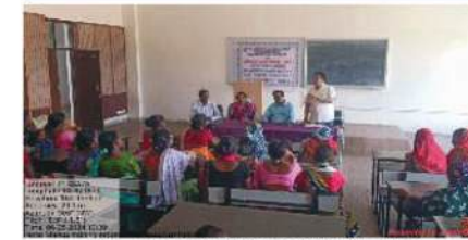
TR. ON MAHUA FLOWER- BIO TECHNOGY DEPARTMENT- SAMBALPUR UNIVERSITY