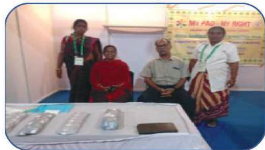
My Pad My Right Stall at KRUSHI MOHATSAV