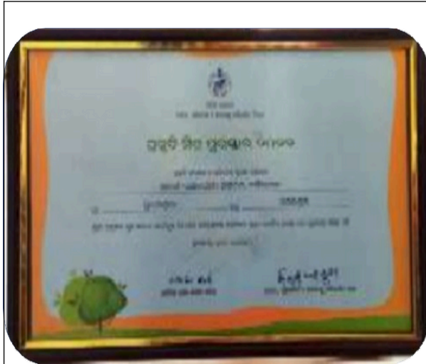
Prakruti Mitra Award By Forest Department Govt of Odisha