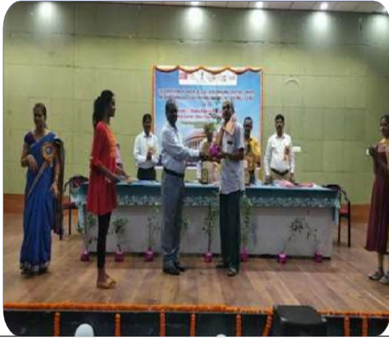
Award For Best NGO By Nehru yuvak Kendra,sambalpur