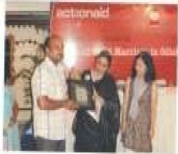
Awarded as Change Maker on Child Marriage by UNICEF & Action Aid for the year 2023.