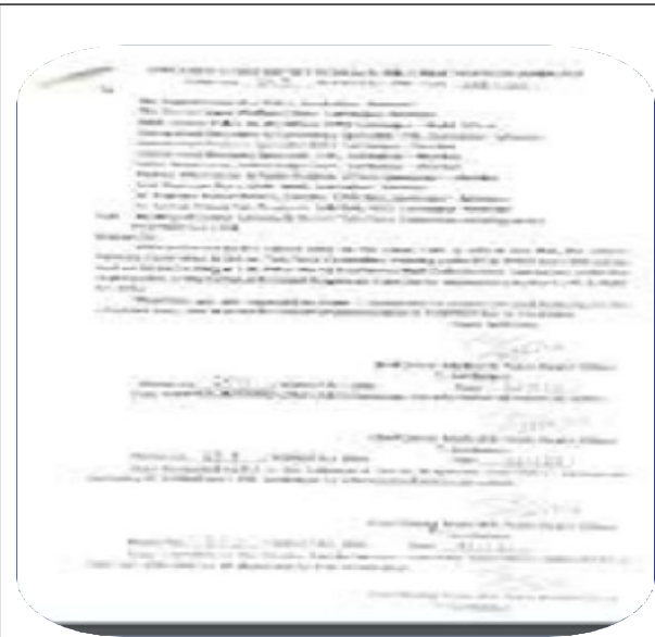
PC & PNDD