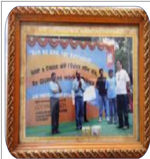
Award for Good will Run For Community By Hindalco, Sambalpur