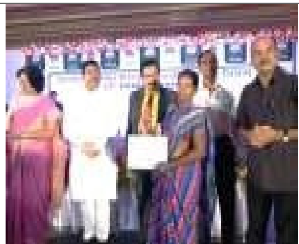
Awarded for Best SHG promotion in Sambalpur,odisha by Honable Dharmendra Pradhan Minister Of Education Govt of India.