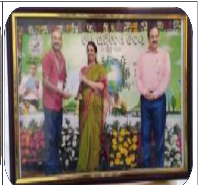
Prakruti Bandhu Award By Forest Department Govt Of Odisha