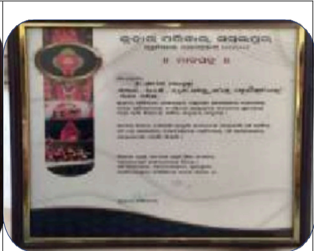
Development Work for Community By Juhar Parivar Sambalpur