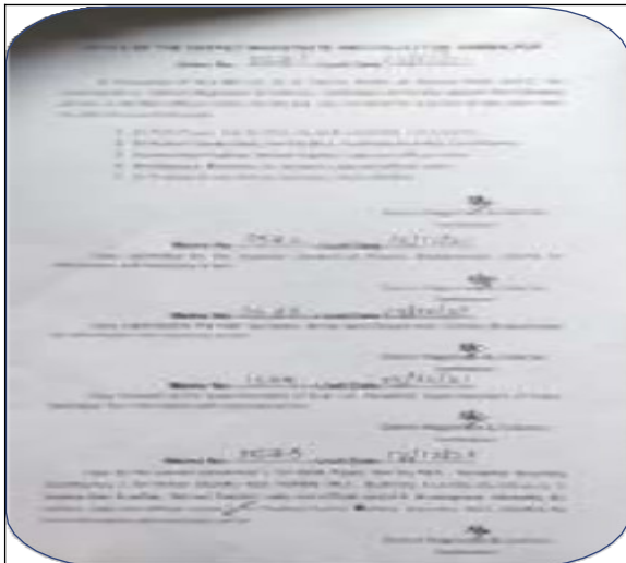
VISITOR FOR SUB-JAIL